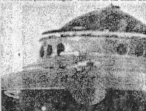
MYSTERY... Is it a spaceship?